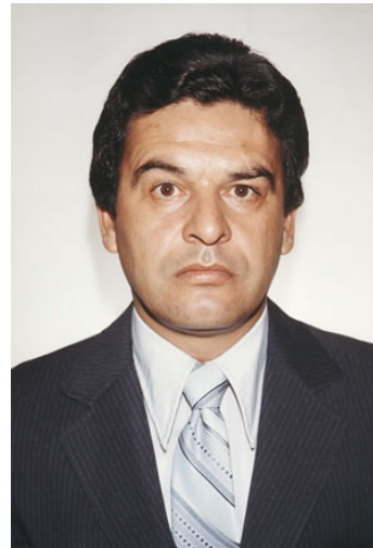
DEA Special Agent Enrique "Kiki" Camarena