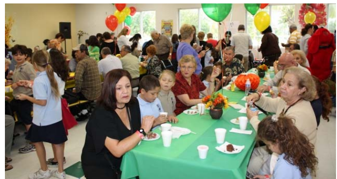
The ACES Grandparents Breakfast was a yummy, family-filled event!